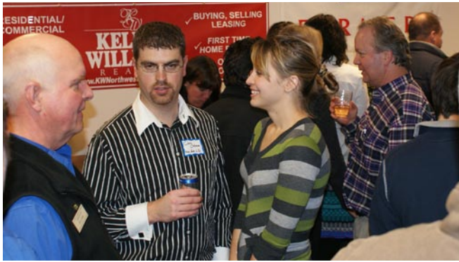
Farmers Insurance - Savage Agency and Keller Williams Realty UNWIND