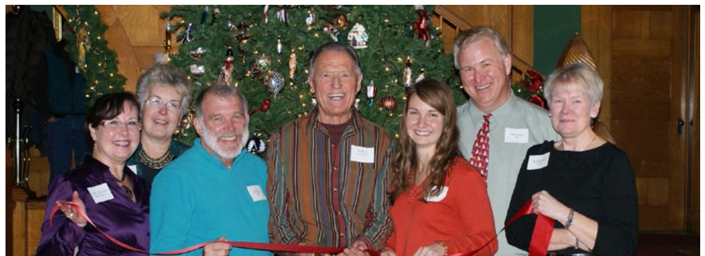
Nonprofit Development Partnership