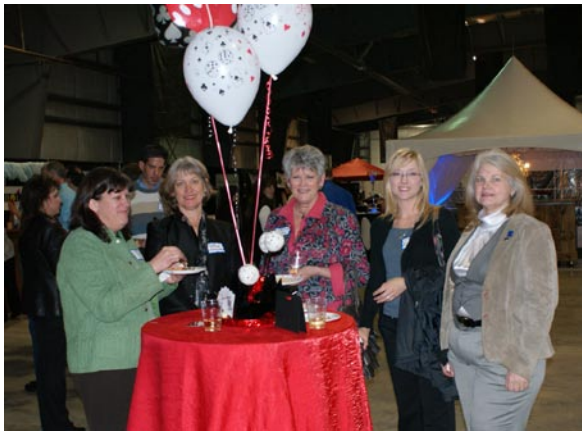
Happy patrons enjoying all the exhibits