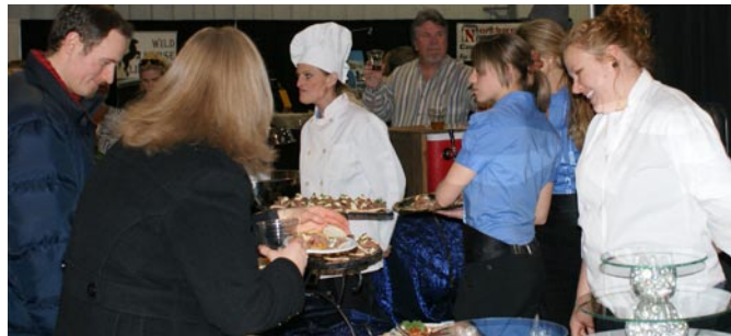
Great cuisine to sample