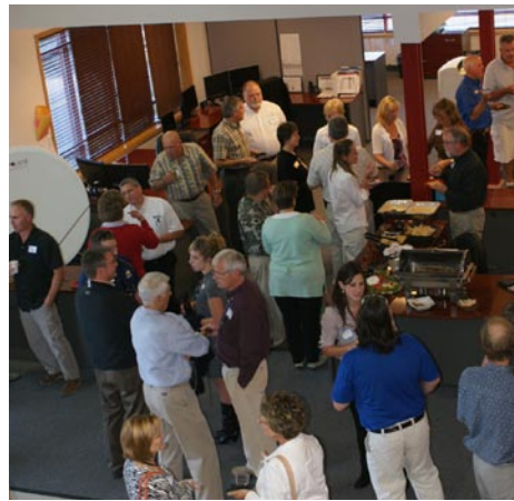
Attendees networking while waiting for a tour of the Nomad facility